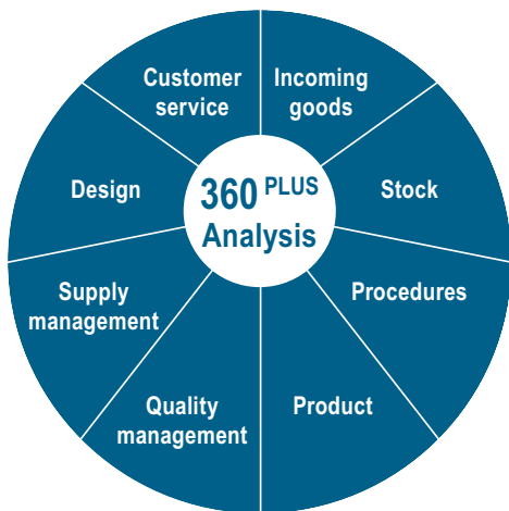
Fig 2: Items considered under 360 PLUS Analysis

The full requirements for an APC implementation can be downloaded on our website under Rules and Guidelines.